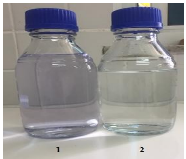
Figure 6 - Textile effluent. (1) - before electroflocculation, (2) - after electroflocculation.

Based on the results showed in Table 1, it can be indicated that the water after treatment in the continuous flow reactor could be applied in several applications such as the production of iron perchloride as suggested in the studies of [8], floors washing, disposal in water bodies, among other applications.