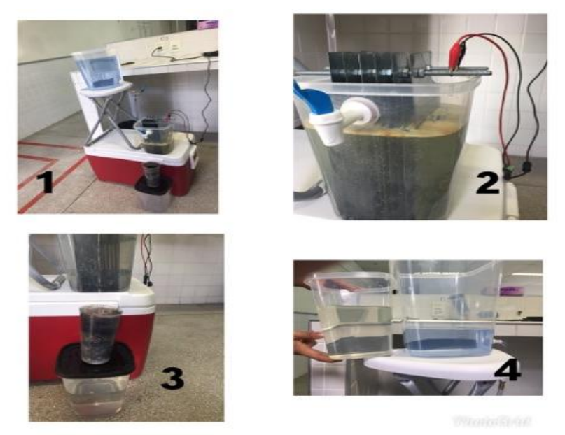
Figure 3- Purification of textile effluent at continuous flow. 1- electroflocculation reactor assembly with continuous flow, 2- electroflocculation reactor, 3 fixed-bed filter, 4-comparison of raw and treated effluent.

For textile effluent analysis, a blue dye (brand TINGECOR) was used in a proportion of 10 mg / L. In total, 16 liters of water were used, the effluent was then divided into two 8-liter containers each. A vessel with the effluent was stored so the analysis could be performed prior to treatment. The other effluent parcel was submitted to treatment by electroflocculation with zinc electrodes. For the effluent submitted to the treatment, 8 g of NaCl were added as electrolyte and after 12 minutes of treatment the sample was submitted to a filtration process. Subsequently, the crude and treated effluent were analyzed. The experiment execution can be observed according to Fig. 3.