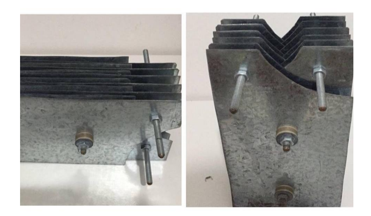
Figure 2 - Monopolar plates arrangement connected in parallel.

For plates construction, a monopolar model was used in parallel as shown in Fig. 2. Zinc plates were dimensioned with 12x24 cm with a total of 12 plates arranged in parallel with 6 mm spacing between them.