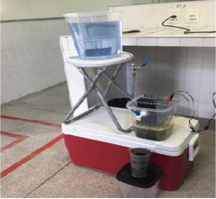
Figure 5- System mounted during textile effluent treatment.