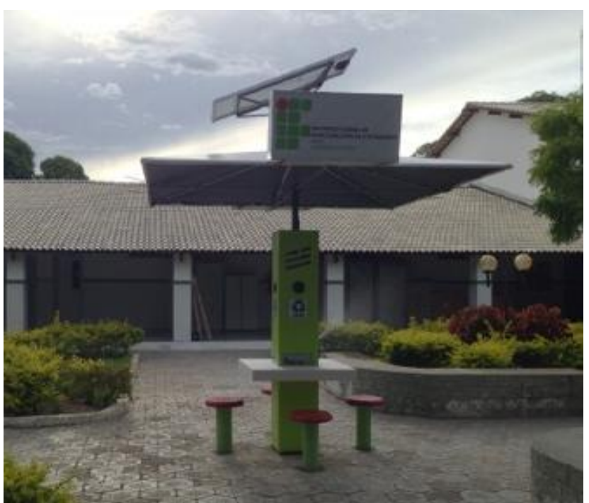
Figure 4- Photovoltaic system used for supling DC current.

The photovoltaic system used to as DC current source is presented in Fig. 4 [11]. The system was built to serve as a recharge center for mobile phones, tablets, notebooks, and serves as an integration site for students and servers of the Federal Institute of Education, Science and Technology of Bahia (IFBA), Paulo Afonso Campus. Its basic construction has the following structure: a) Frequency Inverter: Hayonik Modified Wave Inverter, 400 W 12 V / 127 V; b) Power Controller CMTP02 12 V and 10 A; c) Solar Panel: Golden Genesis PV-110E, 110 Wp; d) Battery: Tudor stationary 45 Ah.